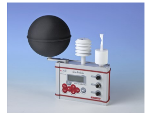
ELR605M / ELR615M: 15 cm diameter black globe sensor