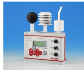
ELR600M / ELR610M: 5 cm diameter black globe sensor

Heat Shield has an algorithm that obtains the temperature of the 5 cm diameter globe (standard according to ISO 7726) starting from the data obtained from the 15 cm diameter globe.