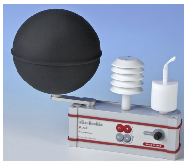
ELR615S: 15 cm diameter black globe sensor satellite modules