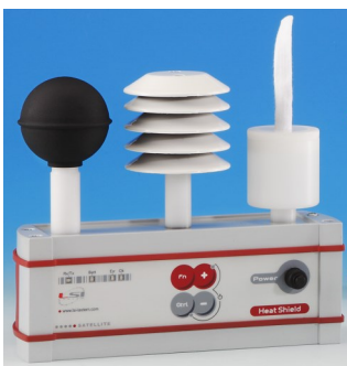
ELR610S: 5 cm diameter black globe sensor satellite modules

The Heat Shield models with radio (ELR610M / ELR615M) can be supplied with additional two wireless satellite modules (ELR610S / ELR615S). The satellite units are used to measure environmental conditions at three positions or levels and calculate Head-Torso-Ankle Weighted Average WBGT. Heat Shield radio can cover up to 300 m in line-of-sight distance, in indoors conditions it may vary.