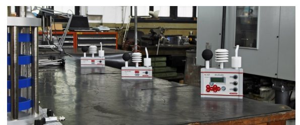
Assesments in three positions of the same environment