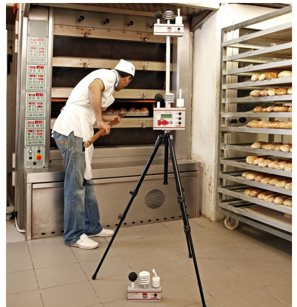
Three levels WBGT on the same vertical