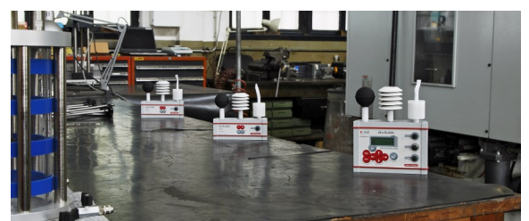
Assesments in three positions of the same environment