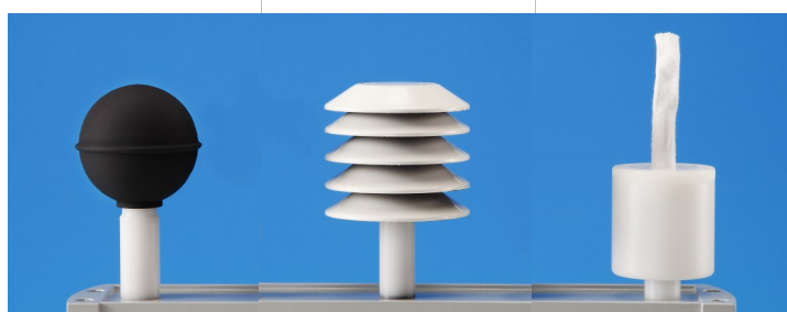
Tg sensor, 5 cm (2") or 15 cm (6") diameter

Heat Shield supports both 15 cm (6") and 5 cm (2") black globes thermometers diameters.